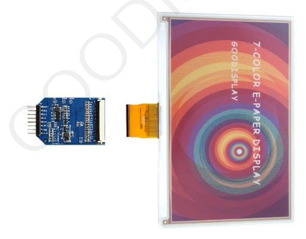
Figure 2: Connection of E-paper display and Adapter

Note: This connector is a rear lock type. When using it, you need to stand up the switch first, insert the E-paper display and then press the switch to lock it.